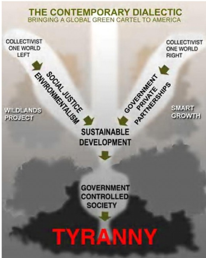
The big picture of taking private and public property